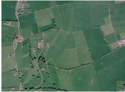
Aerial view of Sadleirswells co Tipperary, 2000

– few features of the designed landscape remain visible compared to maps of 1836