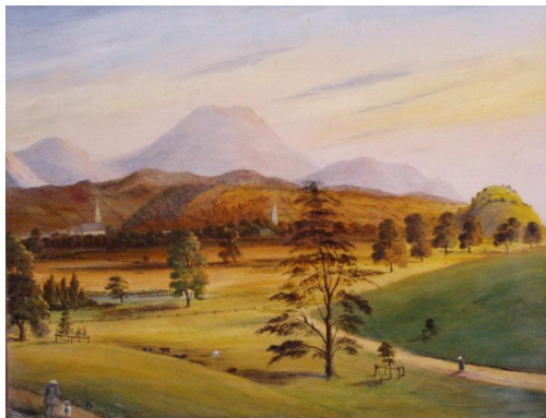
“The Avenue leading to Kingswell House, Tipperary” artist unknown, 1868